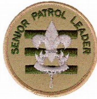
Senior Patrol Leader