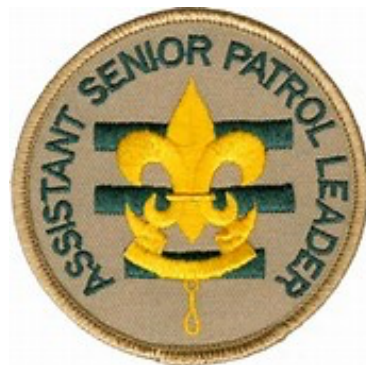
Assistant Senior Patrol Leader