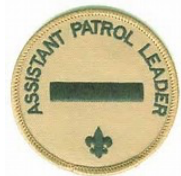
Assistant Patrol Leader